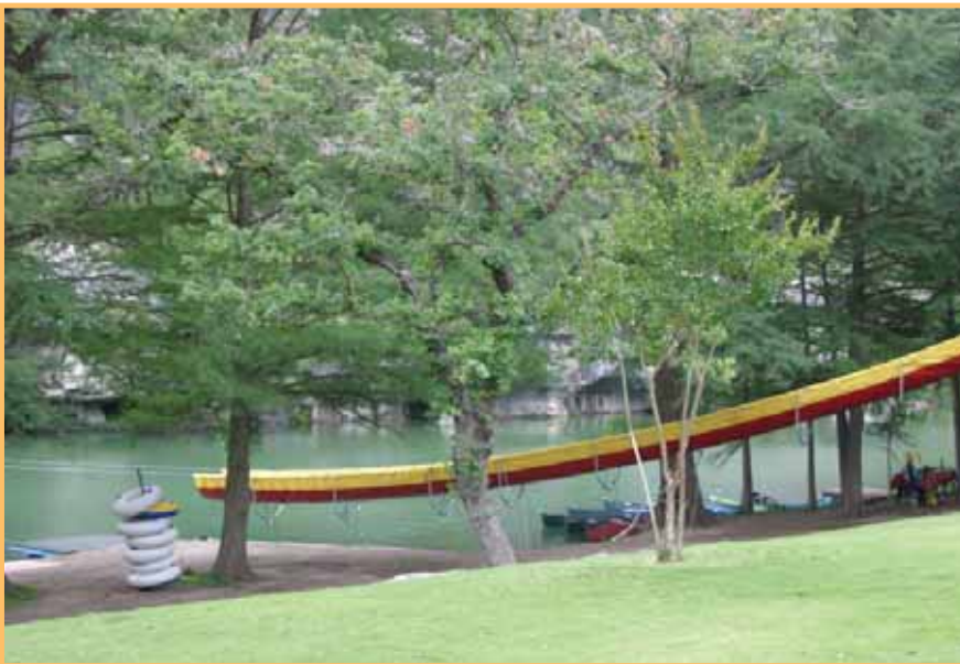
New slide for summer fun at Echo Valley Laity Lodge Youth Camp