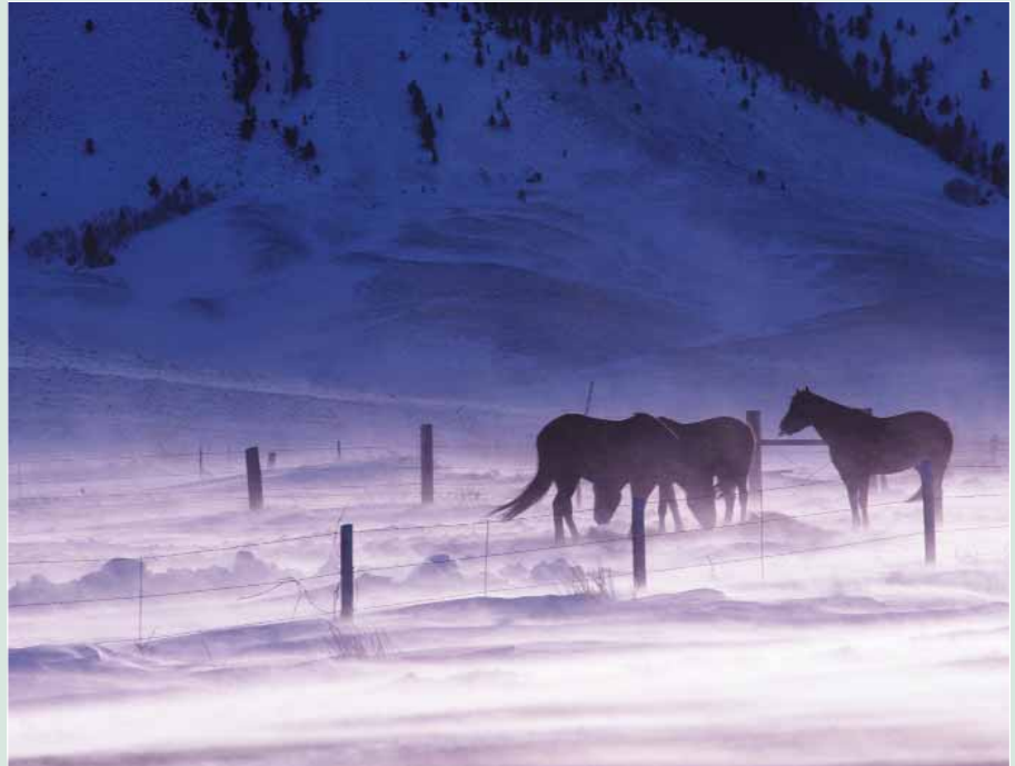
Representing horse camp in a cold Alberta winter.

A few years ago, I had a conversation with the wranglers in charge of the horses at one of the InterVarsity Ranch camps in Alberta, Canada. We talked about the hors-