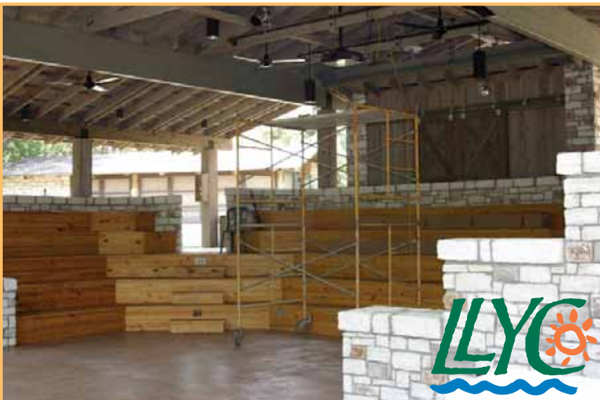
New Pavilion at Singing Hills